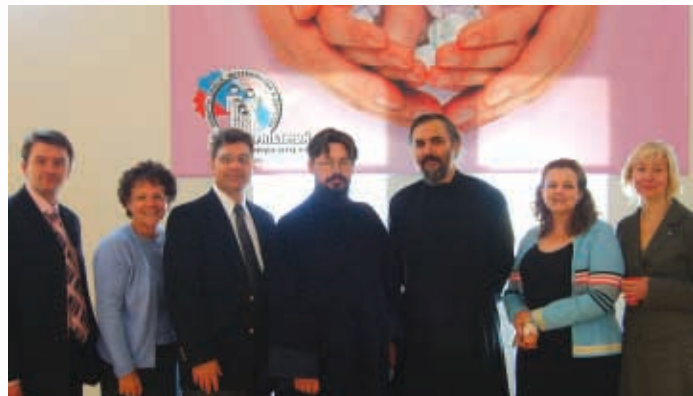
Orthodox Conference in Moscow, October 2007